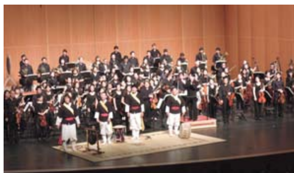
The 2nd Asia Orchestra Festival in Andong, Korea (2013)