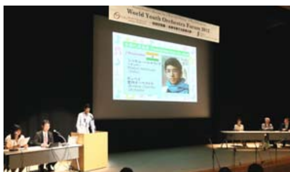
World Amateur Orchestra Festival in Shizuoka (2012)