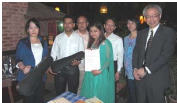
Musical instrument donation to Nepal (2014)