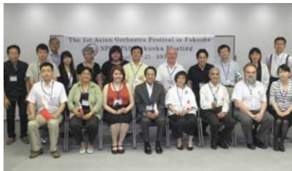
The 1st Asian Orchestra Festival in Fukuoka (2011)

Sharing orchestral practice and promoting exchanges between players or orchestras all over the world crosses language, race, customs and cultural barriers in general through the common language of music because the music scores of Mozart or Beethoven remain the same and can be shared by all art lovers in the world, thus improving universal understanding. It is by contributing to common understanding beyond political, cultural, racial and language barriers that NPO-WFAO intends to contribute, ever so little, to peace in the world.